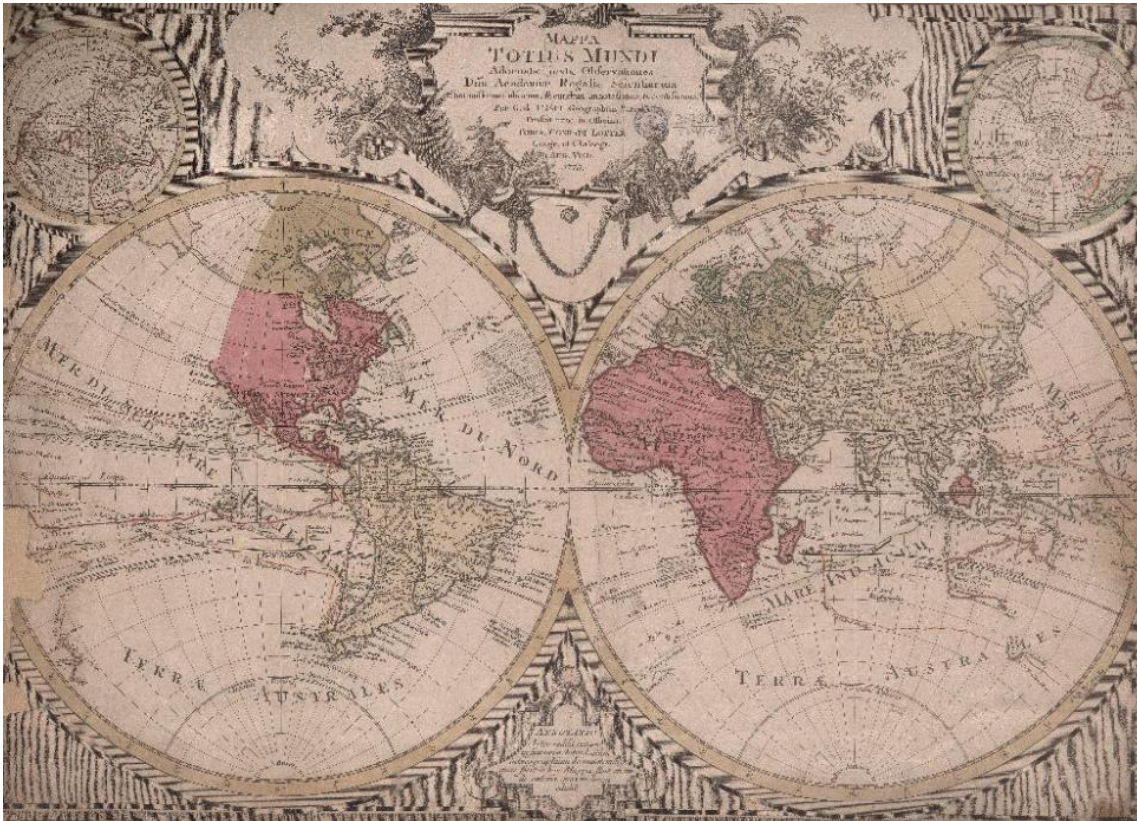
Mapa-múndi latino do final do século XVIII de Tobias Lotter. http://www.wdl.org/pt/item/7/